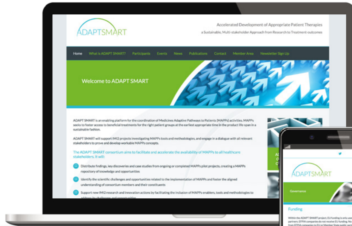
Fully responsive website

Logo design and brand ID across electronic channels